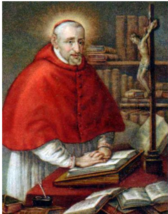
St. Robert Bellarmine Patron of Catechists & Catechumens Pray for us