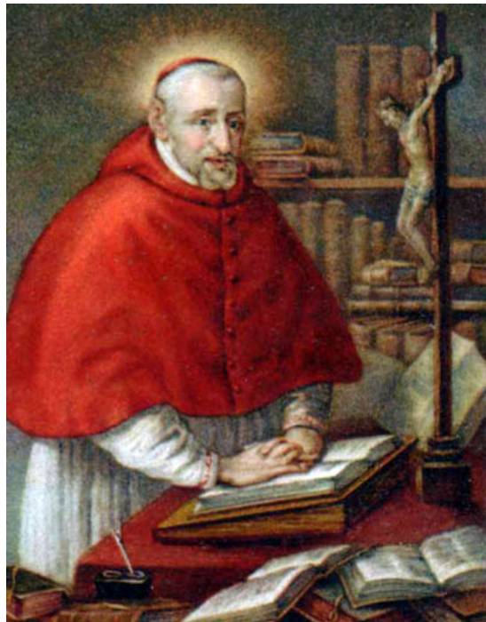
St. Robert Bellarmine Patron of Catechists & Catechumens Pray for us